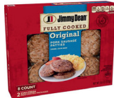
JIMMY DEAN FULLY COOKED BREAKFAST SAUSAGES