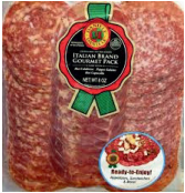
DANIELE ITALIAN HOT SLICED MEATS