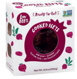
FRESH READY TO EAT COOKED BEETS