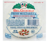
BELGIOIOSO FRESH MOZZARELLA