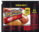
BALL FRANKS 24CT. RESEALABLE PACKAGING (FAMILY SIZE)