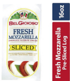
BELGIOIOSO FRESH MOZZARELLA LOG - SLICED