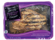
BALSAMIC AND ROSEMARY GRILLED CHICKEN