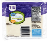
WHOLE MILK MOZZARELLA CHEESE