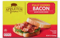
APPLETON FARMS FULLY COOKED BACON