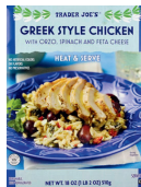
GREEK STYLE CHICKEN W/ ORZO, SPINACH, AND FETA CHEESE