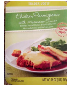
BONELESS BREADED CHICKEN PARMIGIANA W/MARINARA SAUCE