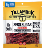
TILLAMOOK ZERO SUGAR SMOKED SAUSAGES (ORIGINAL)