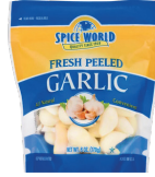
FRESH PEELLED GARLIC