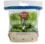
WF GREEN PEPPERS