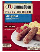
JIMMY DEAN ORIGINAL SAUSAGE 48CT