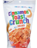
CINNAMON TOAST CRUNCH (RECLOSEABLE PACKAGE)