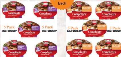
HORMEL COMPLEATS SALISBURY STEAK W/POTATOES