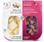
SNACK SELECT CHEESE AND NUTS SNACK