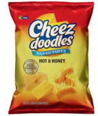
HOT ANDE HONEY CHEESE DOODLES