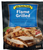
JOHN SOULES FLAME GRILLED CHICKEN BREAST STRIPS