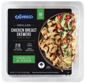
GARLIC AND HERB GRILLED CHICKEN BREAST SKEWERS