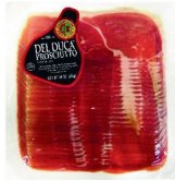
DEL DUCA PROSCIUTTO