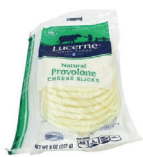
LUCERNE PROVOLONE CHEESE SLICES