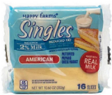
HAPPY FARM REDUCED FAT AMERICAN CHEESE SINGLES