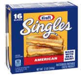
KRAFT AMERICAN CHEESE SINGLES