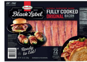
HORMEL BLACK LABEL BACON