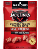
JACK LINK'S SWEET BBQ CHICKEN TENDER BITES