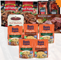
BIG MEAT COMBO