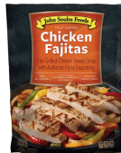
JOHN SOULES CHICKEN FAJITAS