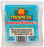
TROPICAL QUESO BLANCO