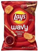
LAYS HICKORY BARBEQUE FLAVORED