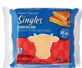
HAPPY FARM AMERICAN CHEESE SLICE SINGLE