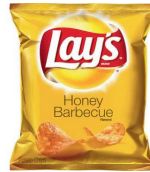
LAYS HONEY BBQ FLAVORED