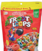
FROOT LOOPS (RECLOSEABLE PACKAGE)