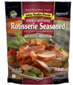
JOHN SOULES ROTISSERIE CHICKEN