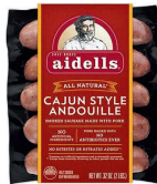
CAJUN STYLE ANDOUILLE SAUSAGE