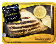
GRILLED LEMON PEPPER CHICKEN