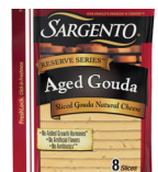
SARGENTO AGED GOUDA CHEESE SLICES