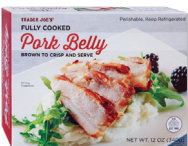
FULLY COOKED PORK BELLY