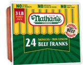
NATHAN'S FAMOUS BEEF FRANKS JUMBO FAMILY 24PK