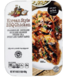
KOREAN STYLE BBQ CHICKEN