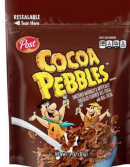
COCOA PEBBLES (RECLOSEABLE PACKAGE)