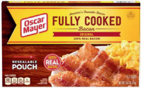
OSCAR MAYER FULLY COOKED BACON