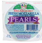
BELGIOIOSO FRESH MOZZARELLA PEARLS