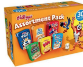
KELLOGG'S JUMBO ASSORTMENT VARIETY CEREAL BOX 30CT