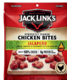
JACK LINK'S JALAPEÑO CHICKEN TENDER BITES