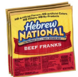
HEBREW NATIONAL BEEF FRANKS 3PK