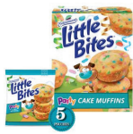
ENTENMANN'S LITTLE BITS BIRTHDAY CAKE