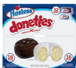
HOSTESS DONETTES ON THE GO 32PK