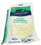
LUCERNE PROVOLONE CHEESE SLICES