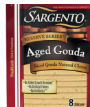
SARGENTO AGED GOUDA CHEESE SLICES