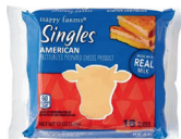
HAPPY FARM AMERICAN CHEESE SLICE SINGLE