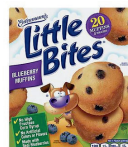
ENTENMANN'S LITTLE BITS BLUEBERRY MUFFINS