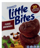
ENTENMANN'S LITTLE BITS FUDGE BROWNIE 5 POUCH