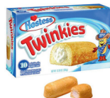
HOSTESS TWINKIES 10CT.