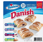
HOSTESS DANISH VARIETY PACK 24 PK