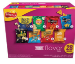
FRITO-LAY FLAVOR MIX VARIETY PACK SNACK CHIPS, 28 COUNT MULTIPACK