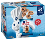
PILLSBURY SOFT BAKED MINI CHOCOLATE CHIP COOKIES