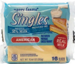
HAPPY FARM REDUCED FAT AMERICAN CHEESE SINGLES