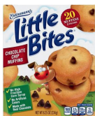
ENTENMANN'S LITTLE BITES CHOCOLATE CHIP