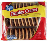
DUPLEX CREME COOKIES