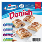
HOSTESS DANISH VARIETY PACK 24 PK